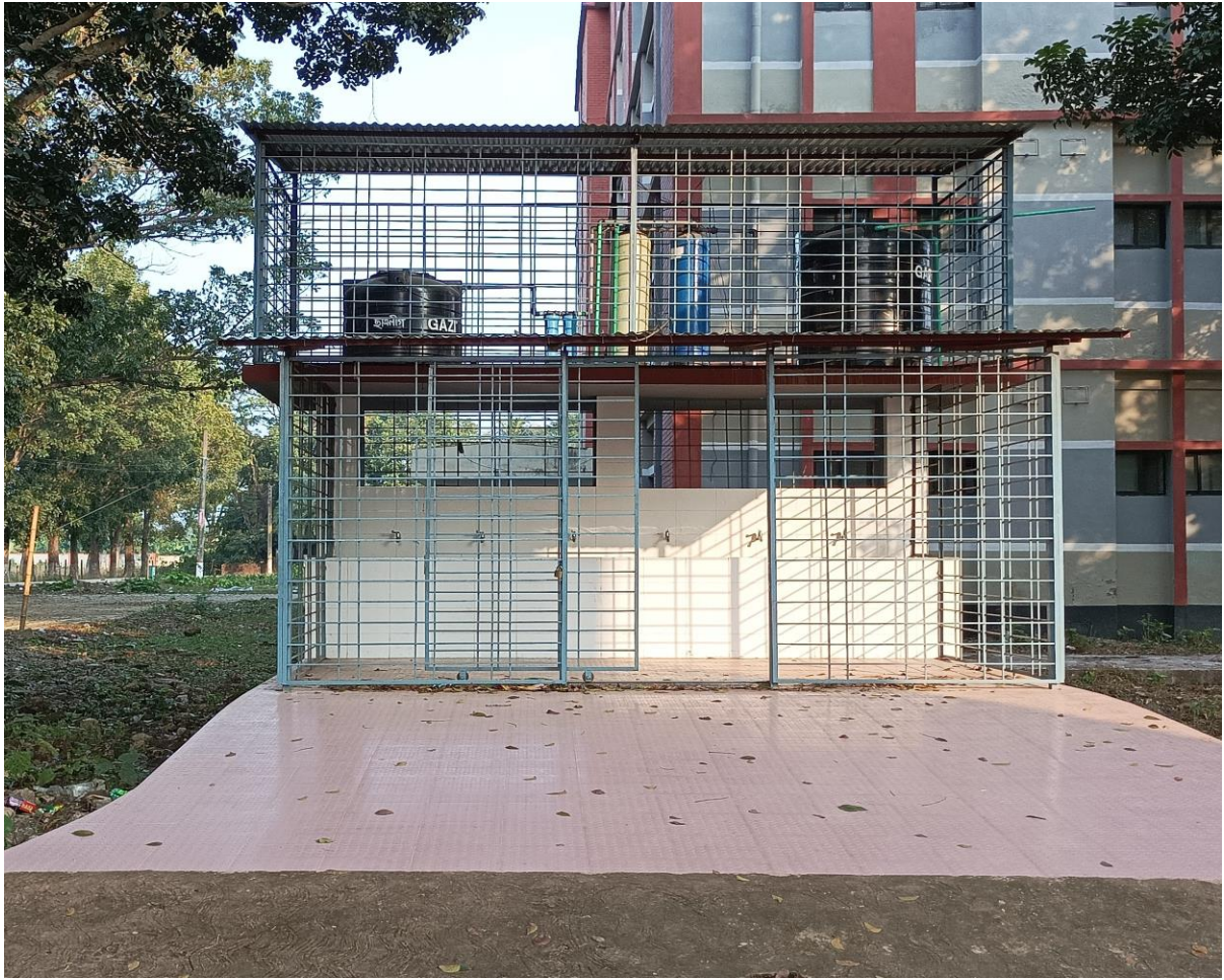
Safe Water Plant